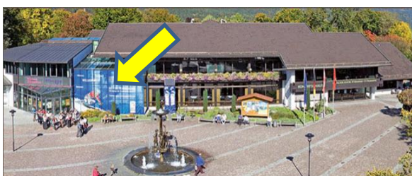
Conference Center building Internet password Wlan: igs