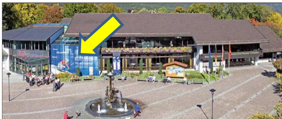
Conference Center building Internet password Wlan: igs